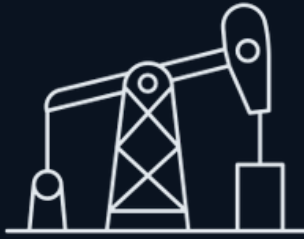
Oil & Energy